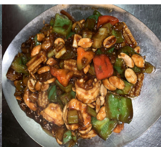
Kon Bo Shrimp