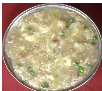
LOBSTER MEAT w/ LOBSTER SAUCE