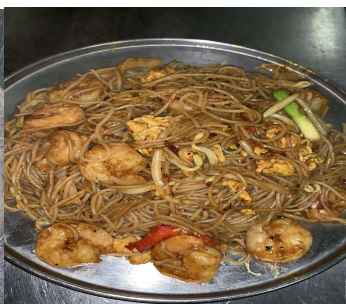
Singapore Rice Noodle