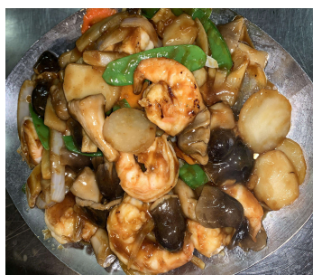
Sin Goo Shrimp

Fresh shrimp sliced open steamed with garlic, soy sauce and garnished with broccoli.