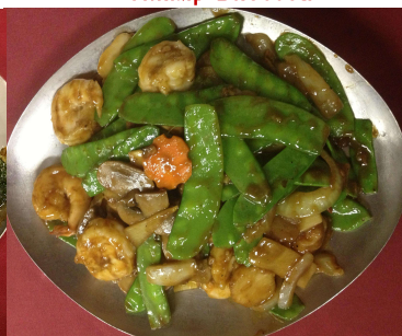
SHRIMP SNOW PEAS

* Hot and Spicy - We will prepare to suit your taste